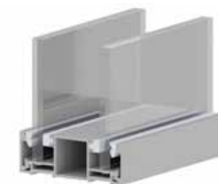
Easy Wall Double