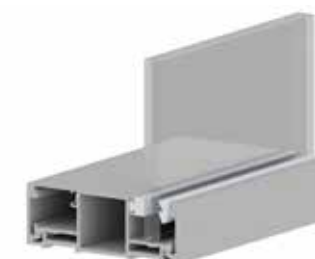
Easy Wall Offset